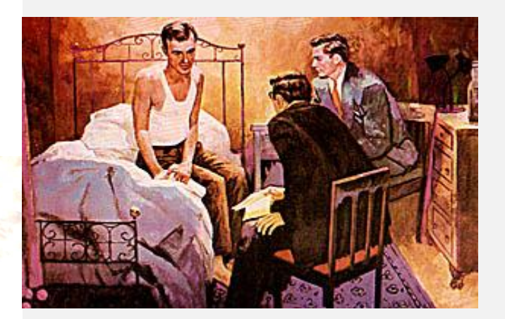
God, grant me the Serenity to accept the things I cannot change, Courage to change the things I can, And the Wisdom to know the difference.

Monday to Friday: 8:45 am to 4:45 pm Business Office: 561-655-5700 1371 Okeechobee Road West Palm Beach, FL 33401 (Map) Email: pbciaa@bellsouth.net