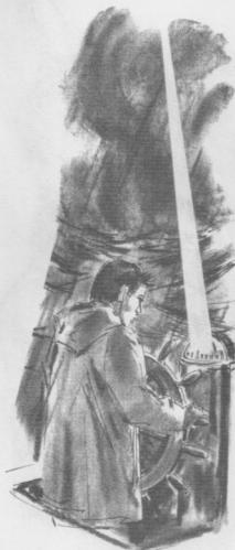
I ask a Higher Power for help to live the right way.

11 Sought through prayer and meditation to improve our conscious contact with God, as we understood Him, praying only for knowledge of His will for us and the power to carry that out.